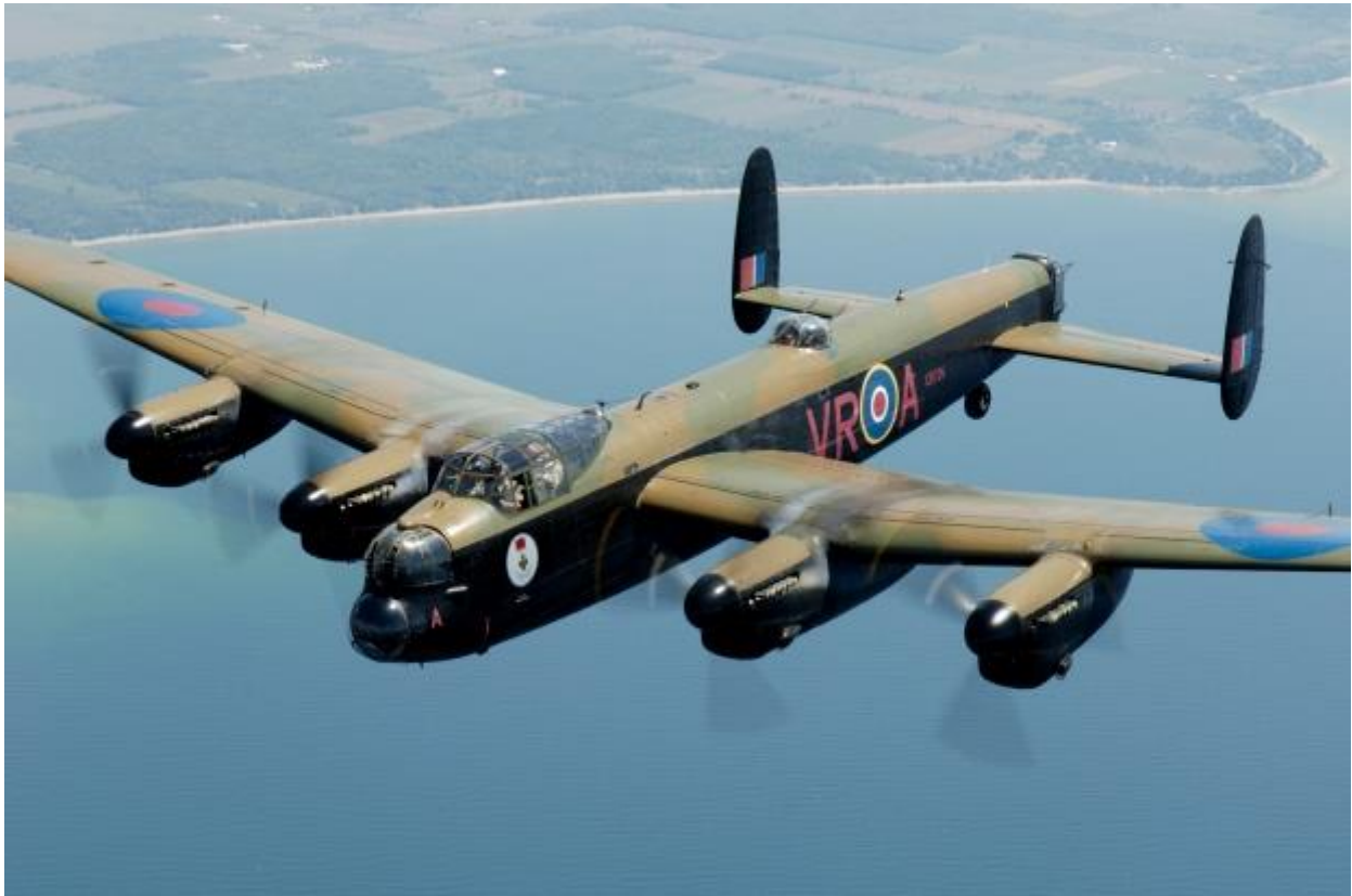
Hamilton's Mynarski Memorial Avro Lancaster Mk X bomber was built at Victory Aircraft in Malton, Ont., in 1945.